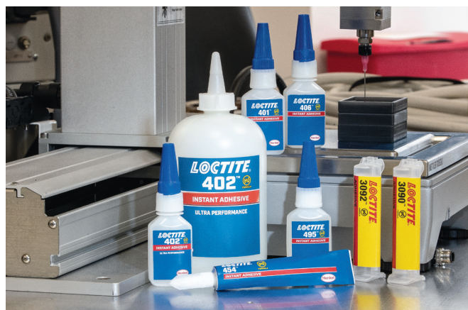
Figure 1. Instant adhesive products identified for reduction in hazardous ingredients.

Significant customer and market studies were carried out to help define the types of ingredients that are of most concern to users. Every chemical manufactured and sold globally has a set of hazard statements and pictograms associated with it, based on the toxicological data available to provide guidance to the user on the risks associated with handling such chemicals. The rules for applying these hazard statements and pictograms are articulated through the Globally Harmonized System of Classification and Labelling of Chemicals (known as GHS). Such statements will appear on the product safety data sheet (SDS) and the associated hazard pictograms will appear on both the product safety data sheet and on the label of the product.