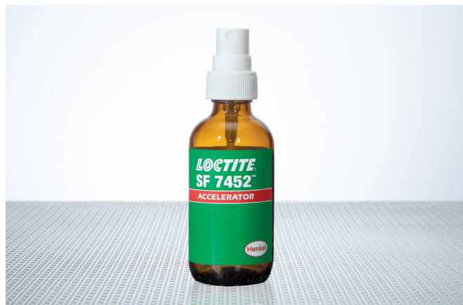
Figure 2. Instant adhesive accelerators identified for reduction in hazardous ingredients.