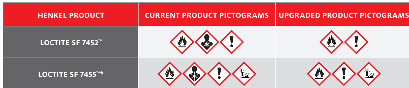
TABLE 8. European Label Pictograms for LOCTITE Accelerators.

*Applies to aerosol version(s) of LOCTITE SF 7455.